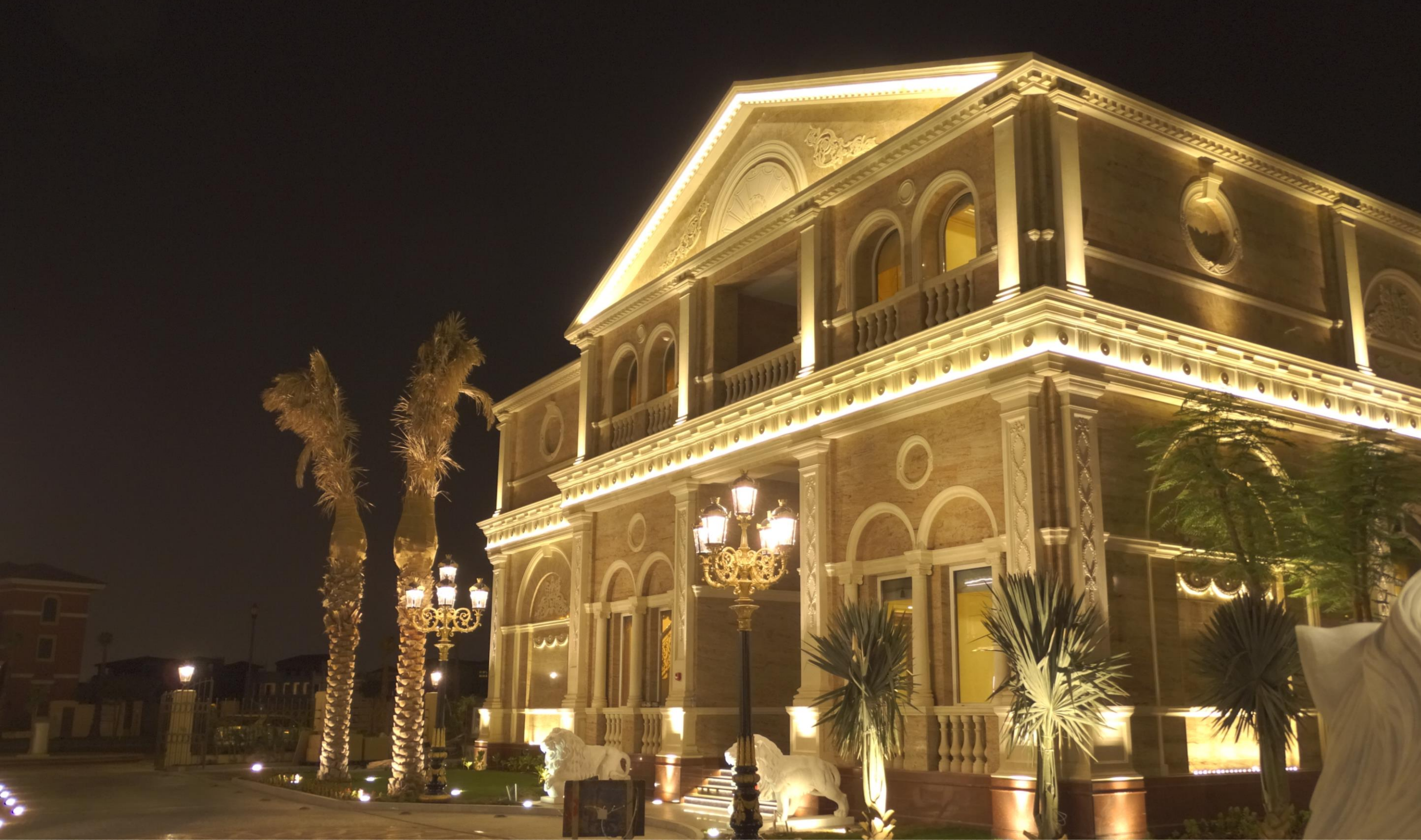
FEATURED PROJECT Ali Al Fardan Villa – The Pearl