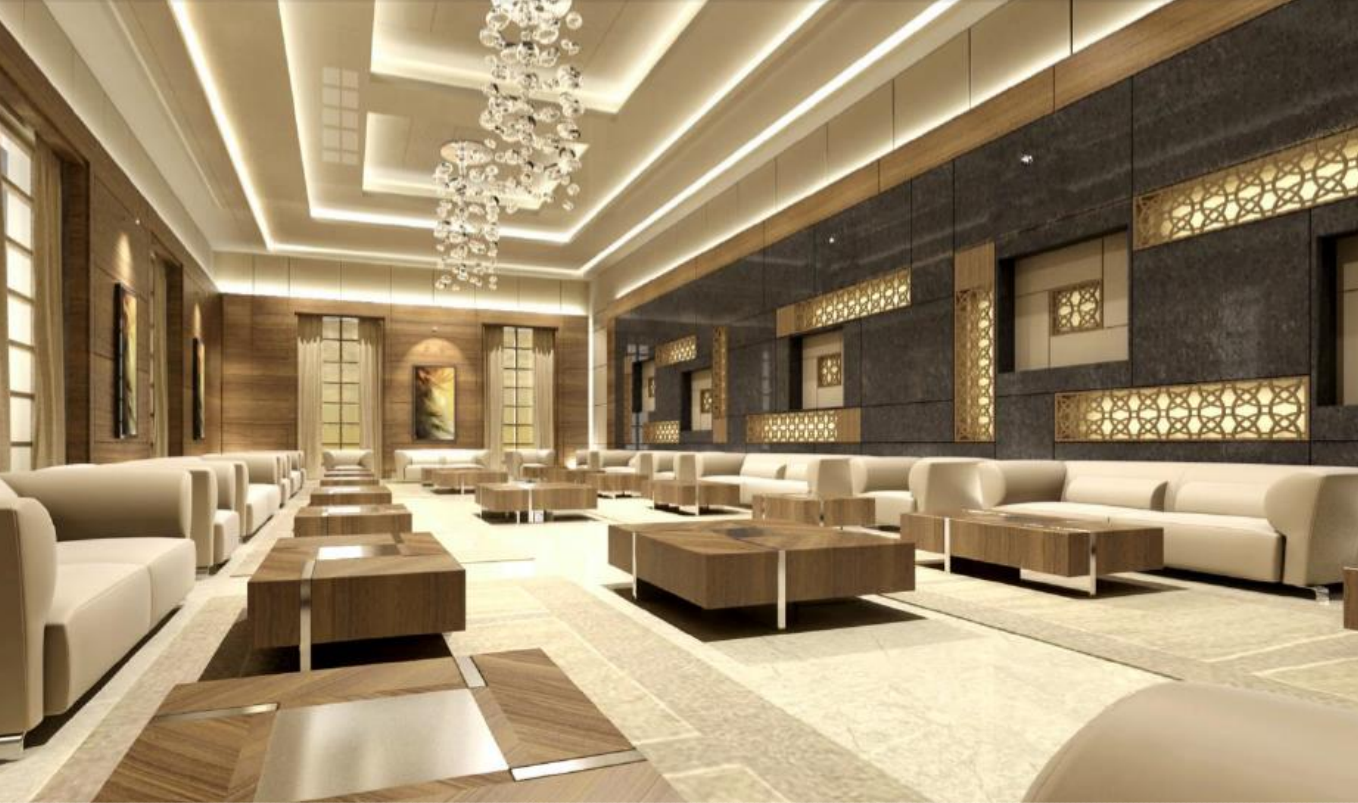
Sheikh Jassim Mosque and Majilis