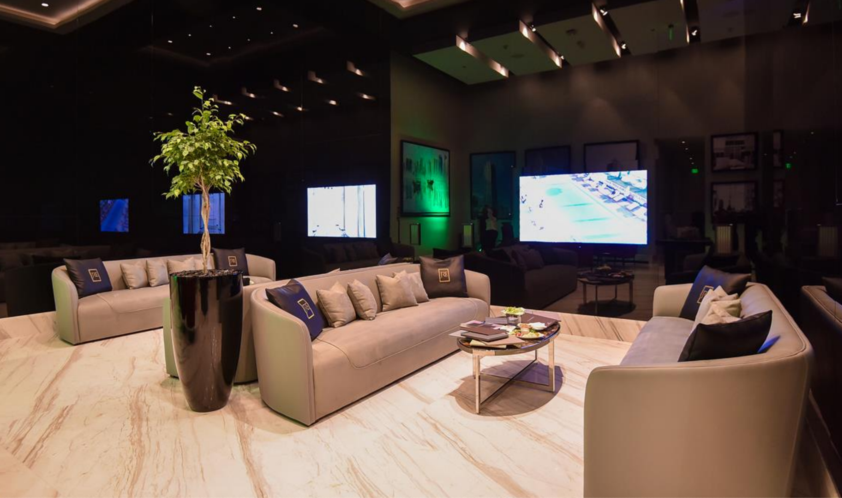
PROJECT SUPPLIED JRE Showroom