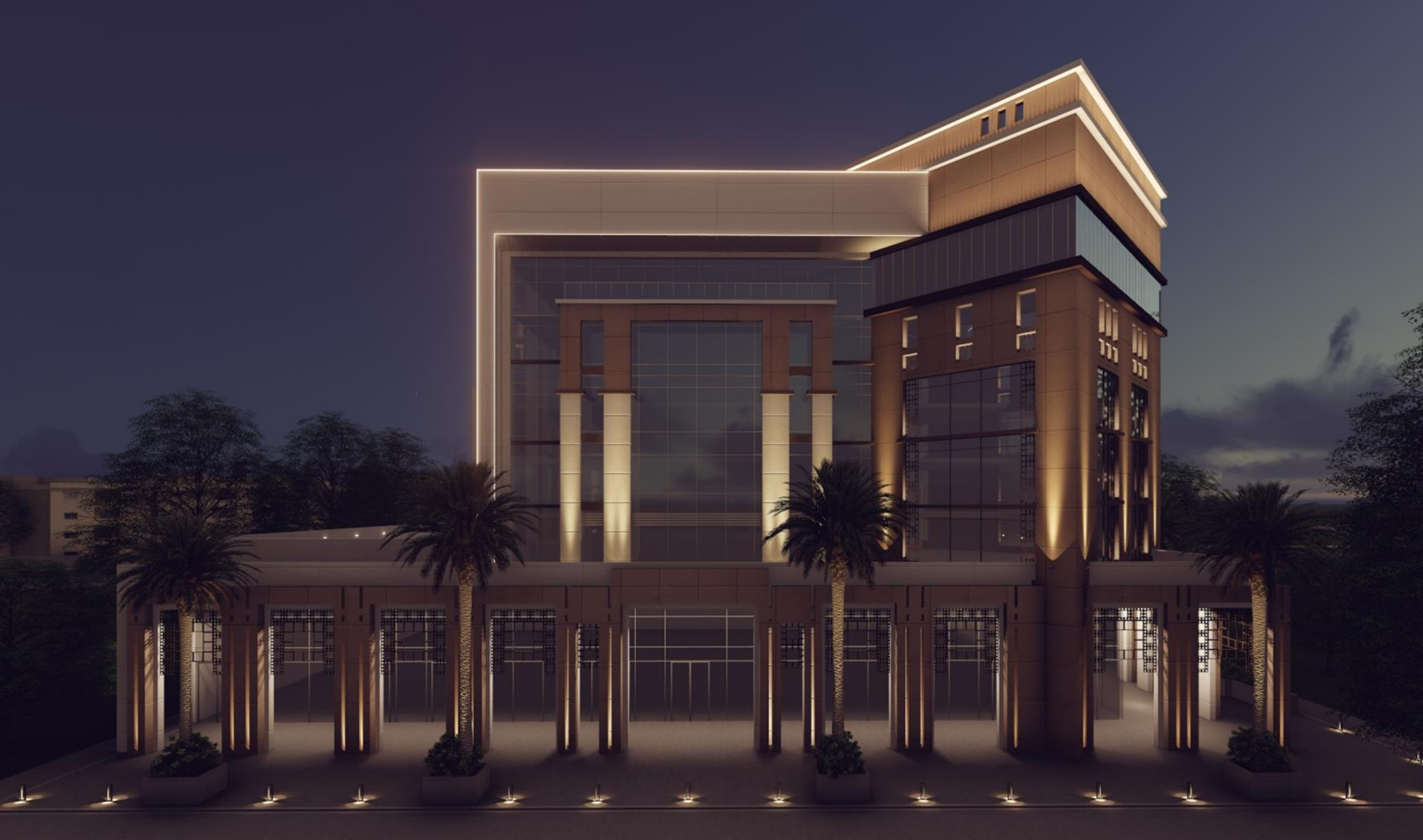
FEATURED PROJECT Al NAQI Center Landscape & Façade Lighting