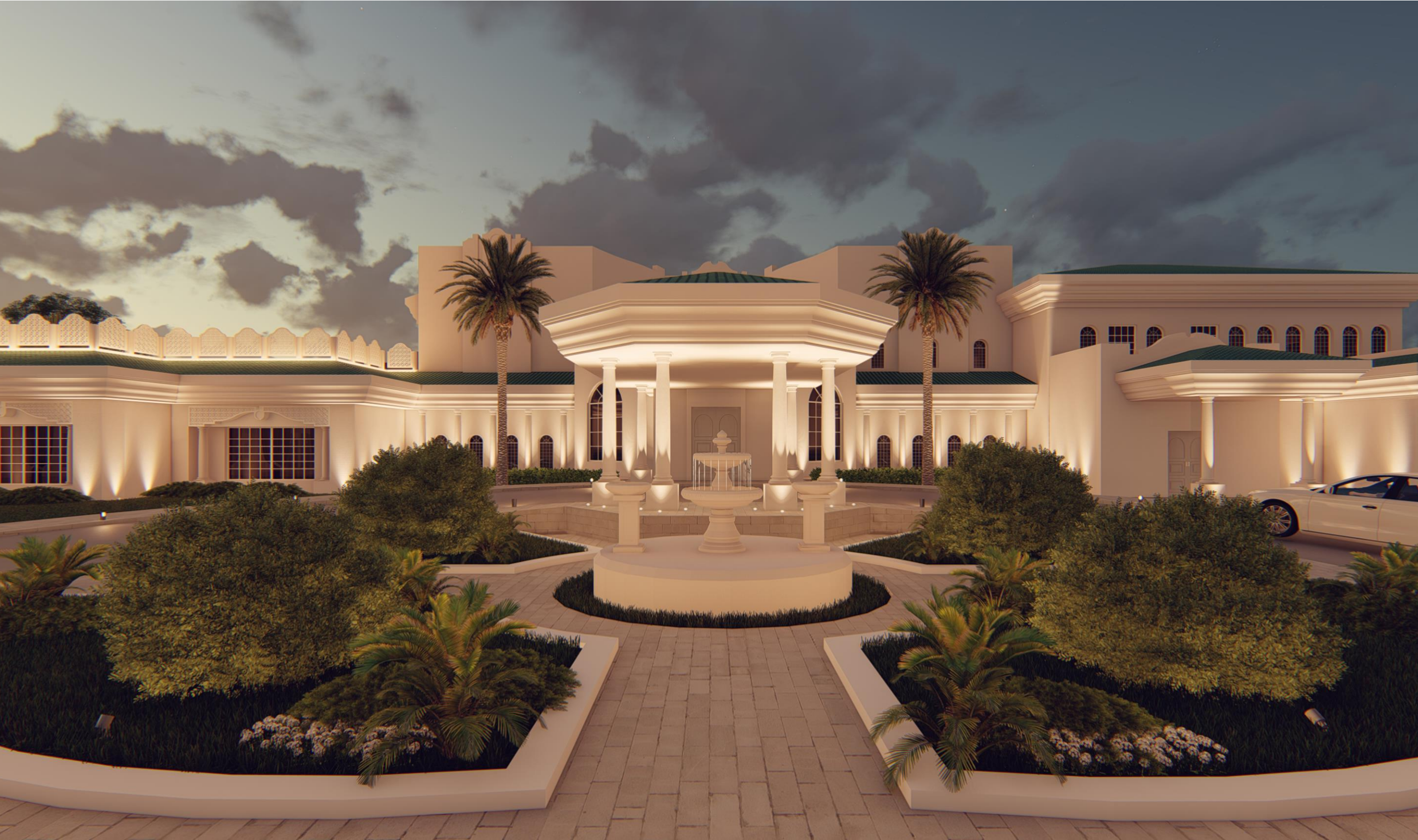
FEATURED PROJECT Dafna Beach Palace