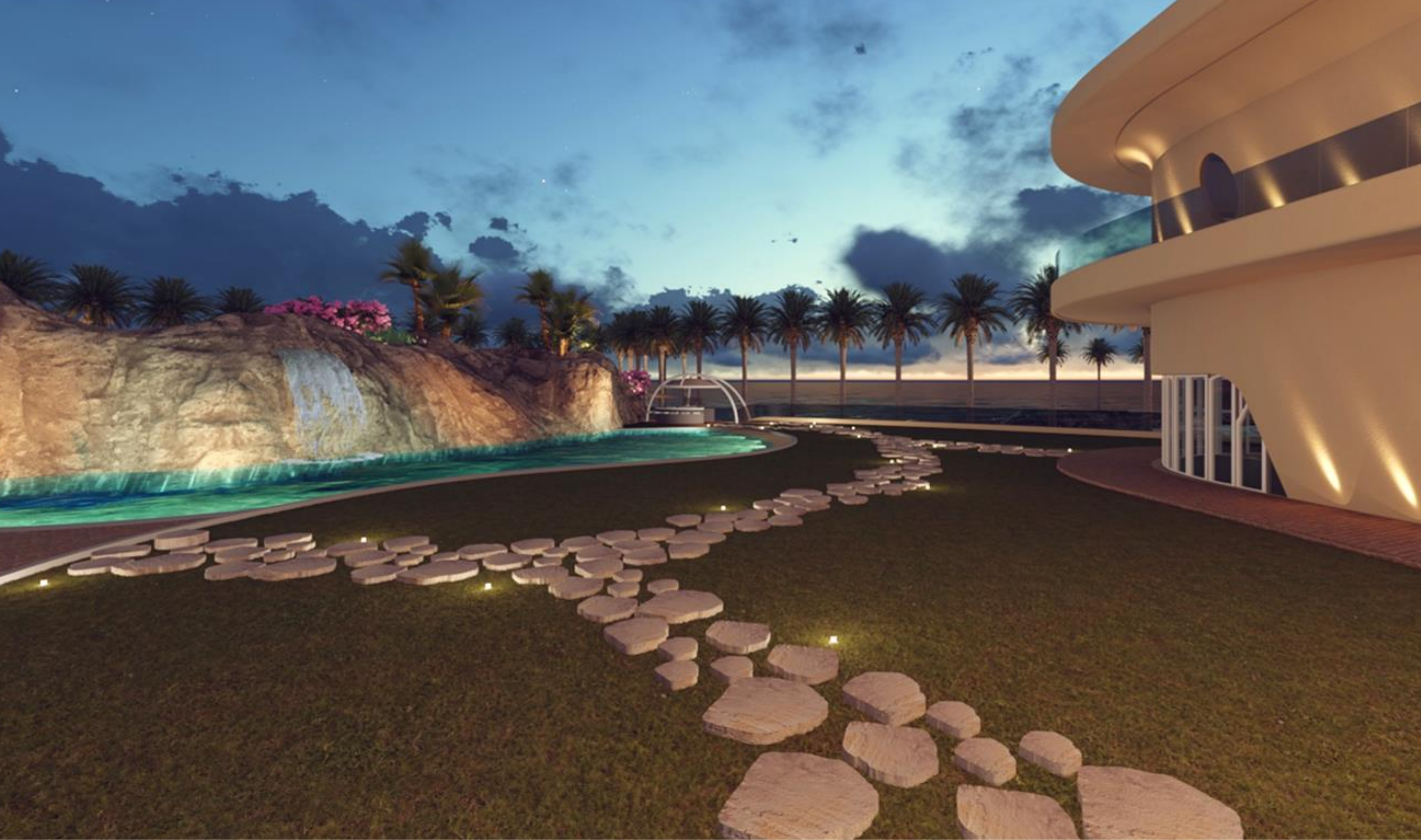
FEATURED PROJECT Isoladana9 Landscape & Façade Lighting