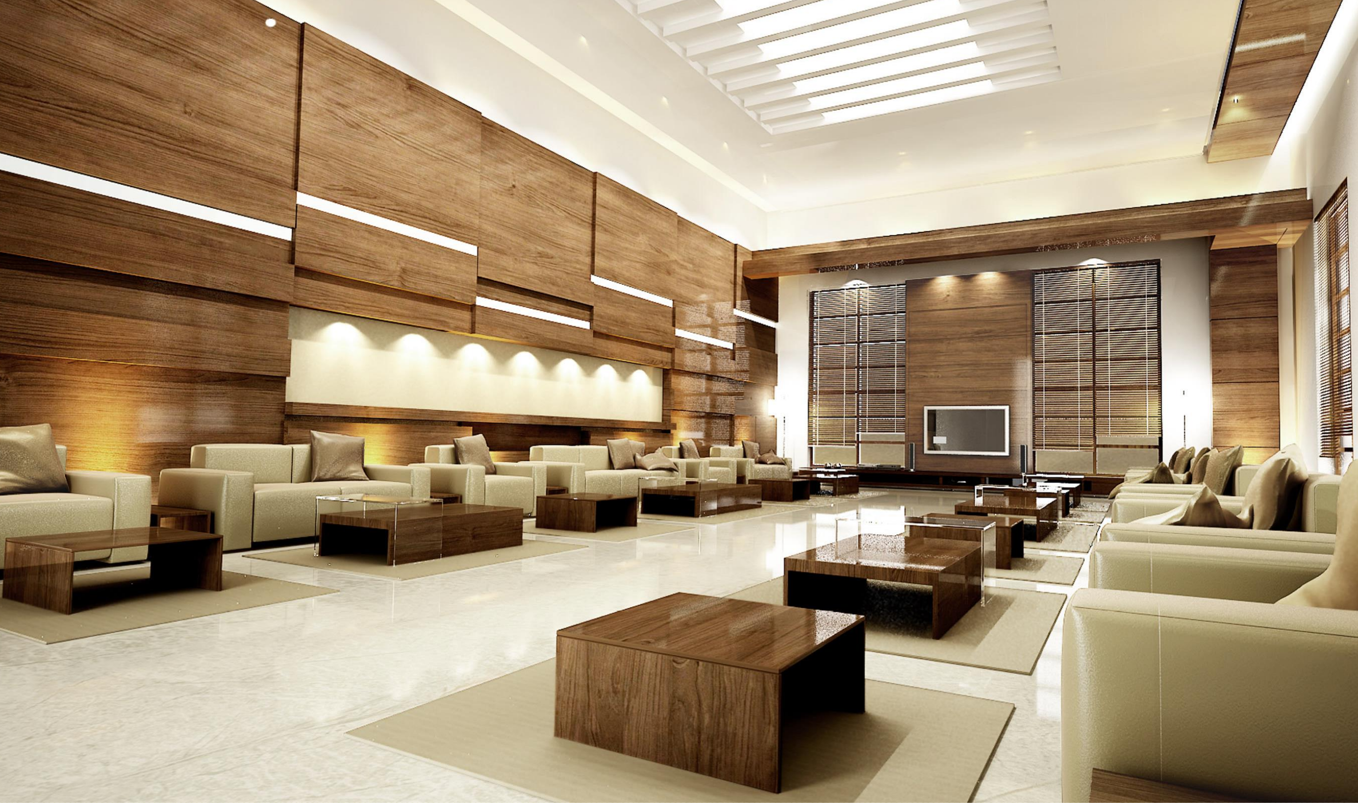
PROJECT SUPPLIED Sheikh Jassim Mosque and Majilis