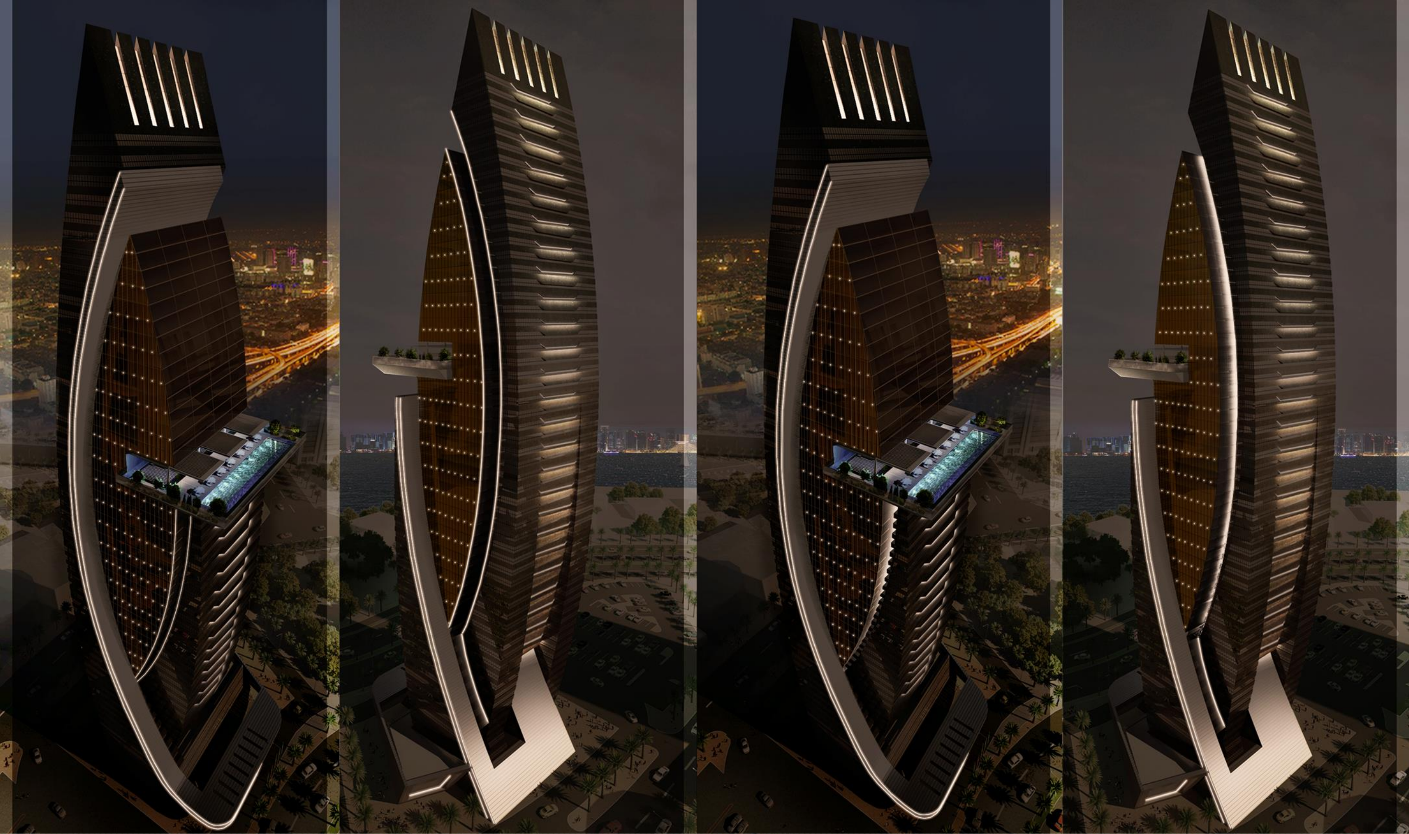
FEATURED PROJECT JW Marriot Hotel Tower, West Bay