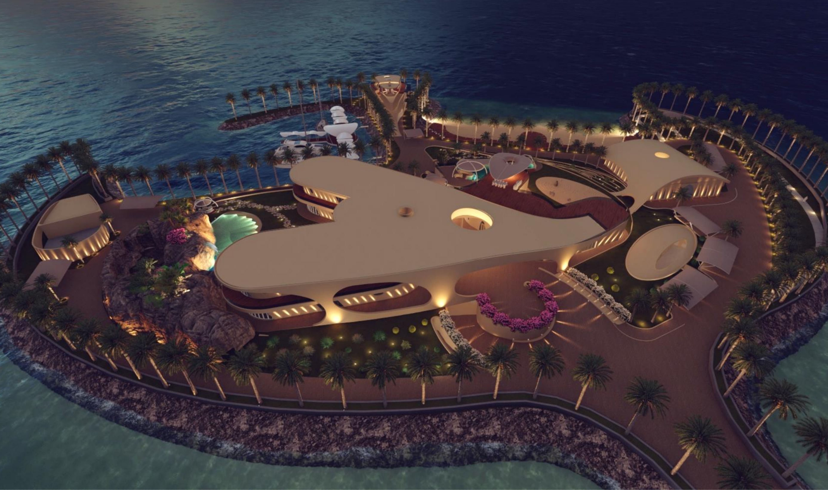
FEATURED PROJECT Isoladana9 Landscape & Façade Lighting