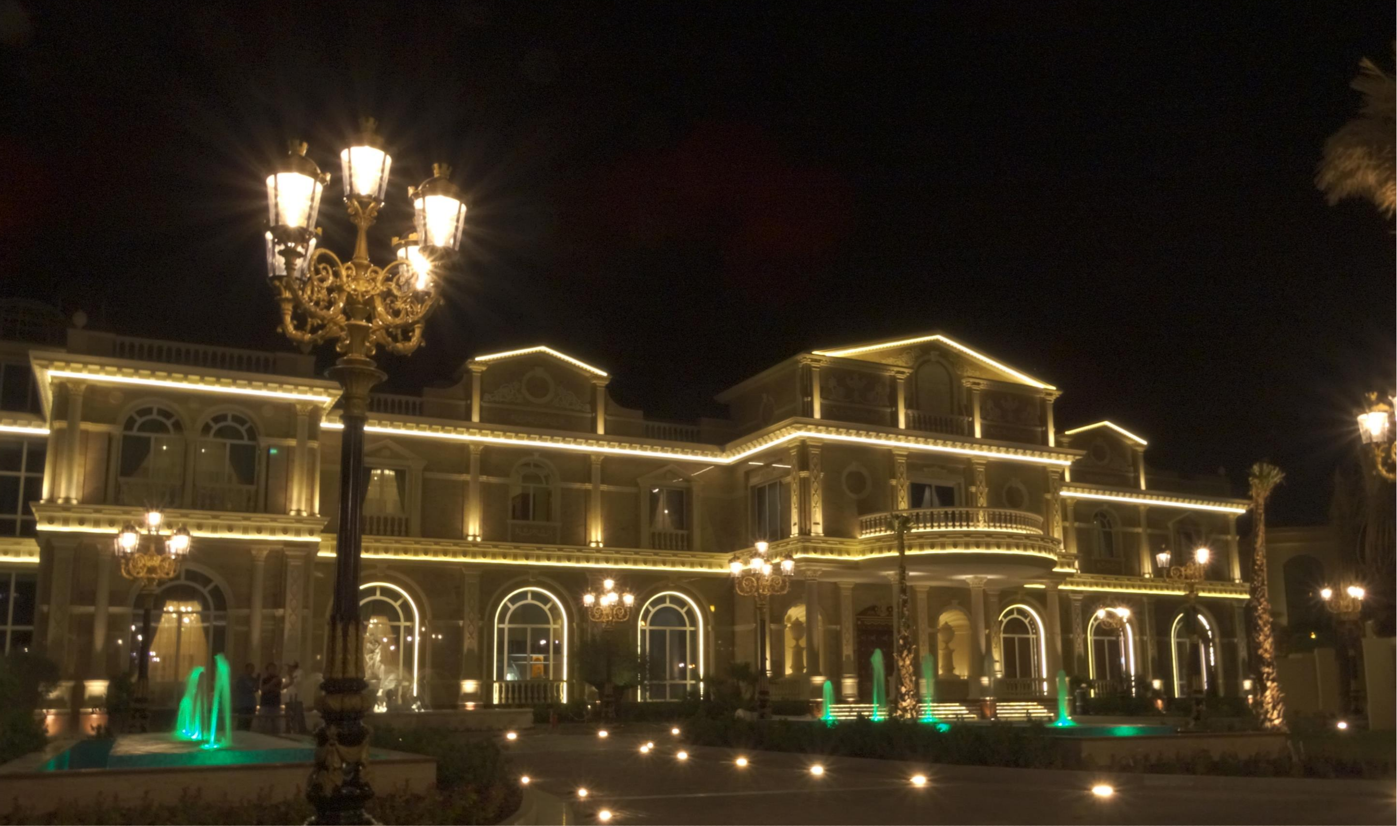
FEATURED PROJECT Ali Al Fardan Villa – The Pearl