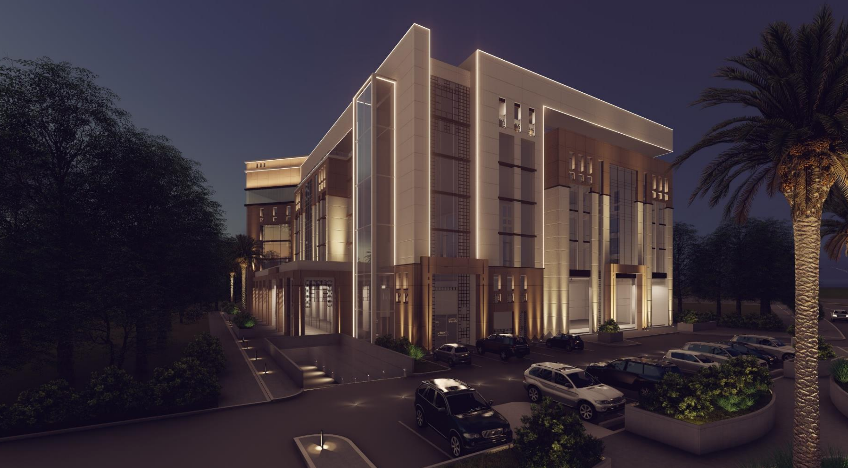
FEATURED PROJECT Al NAQI Center Landscape & Façade Lighting