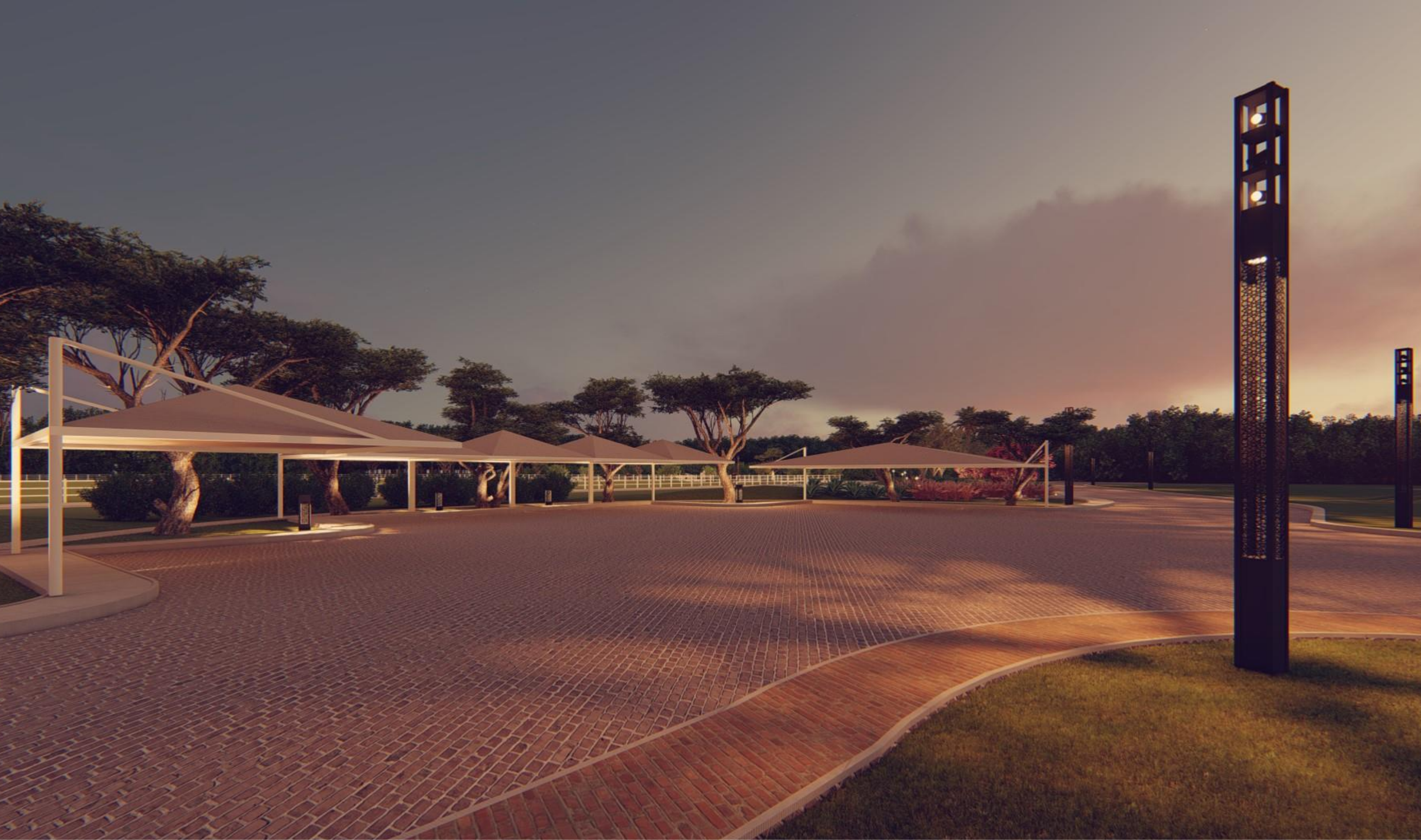
FEATURED PROJECT Al Jassimya Farm House, Al Khor