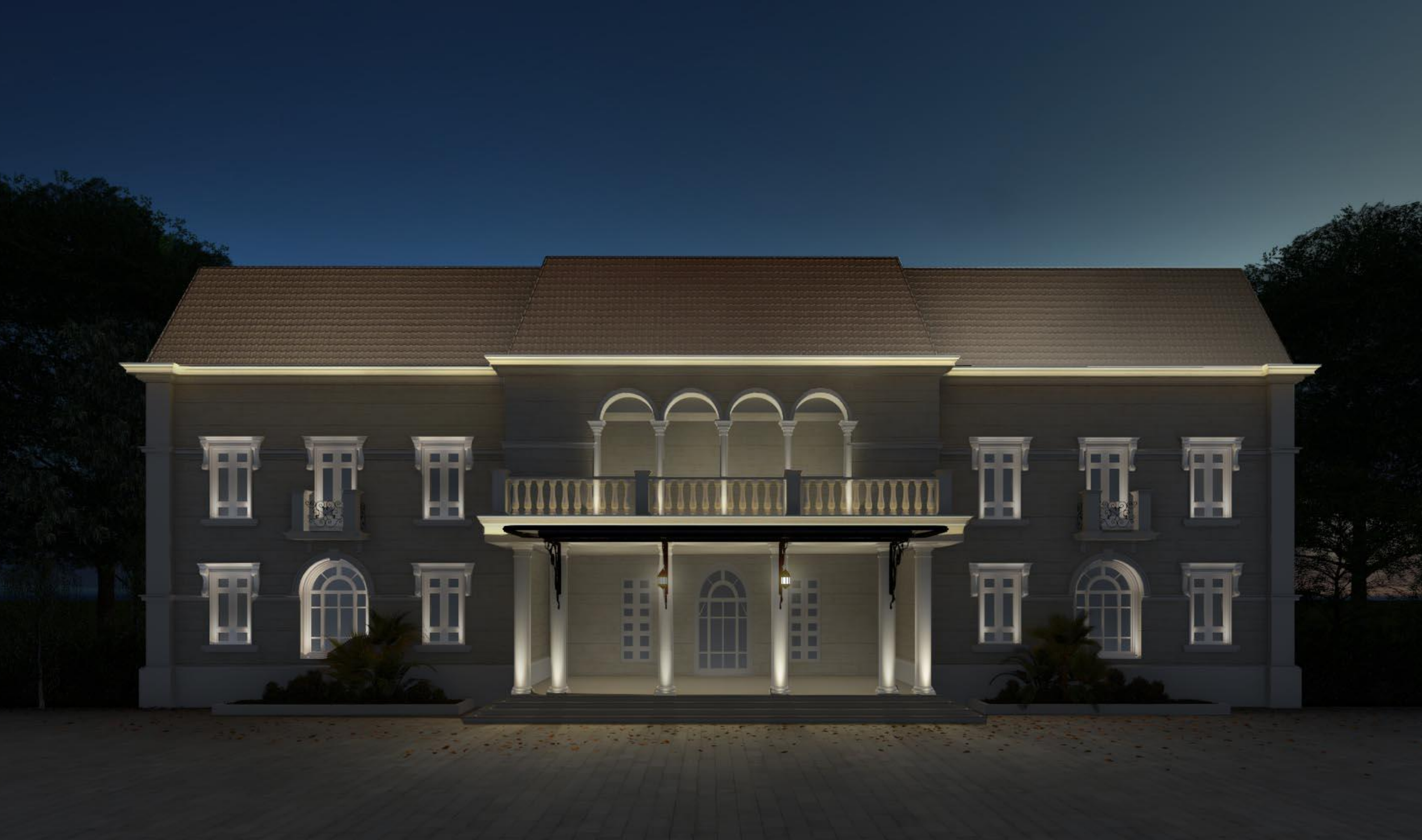
FEATURED PROJECT Al Rayyan Private Villa