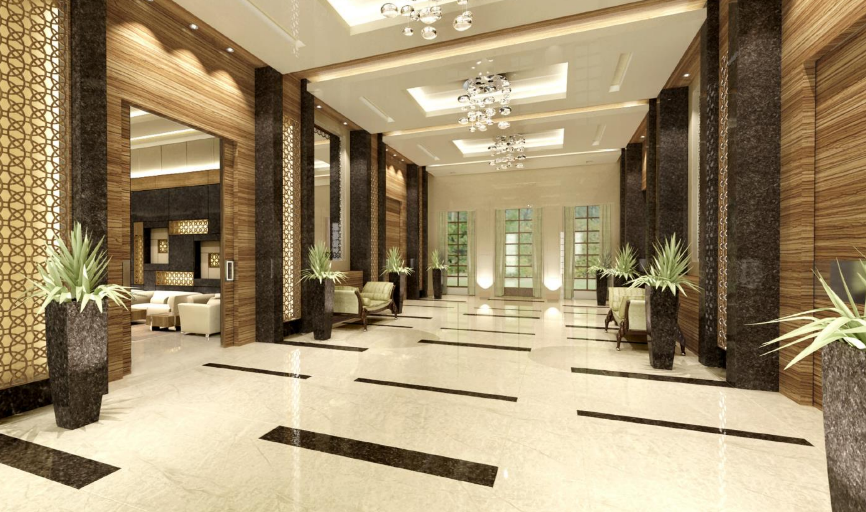
PROJECT SUPPLIED Sheikh Jassim Mosque and Majilis